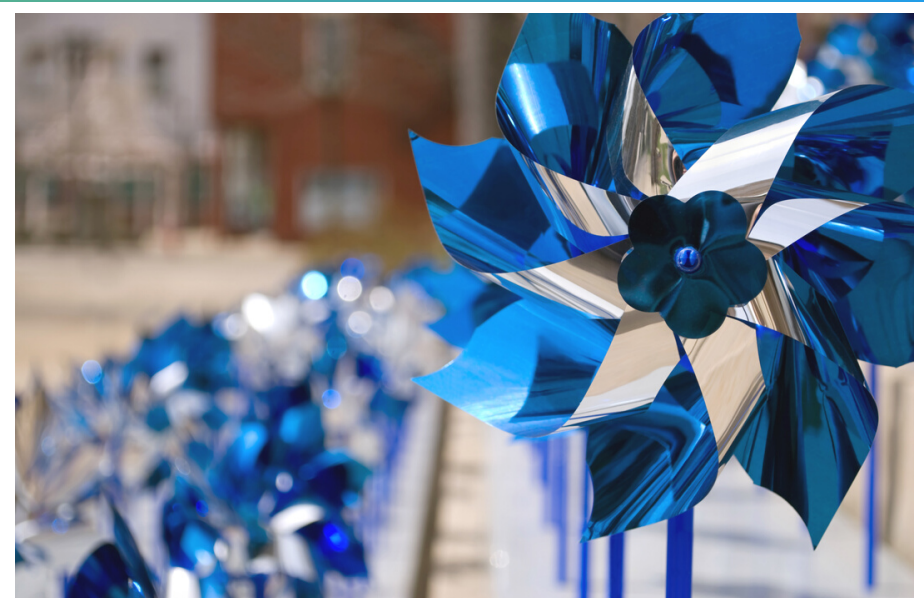
Blue Pinwheels for Child Abuse Awareness Month

We offer 13 contact hours for social workers and counselors which include several clinical hours and 3 hours of ethics. Most workshops will also qualify for clinical hours too. Register today!